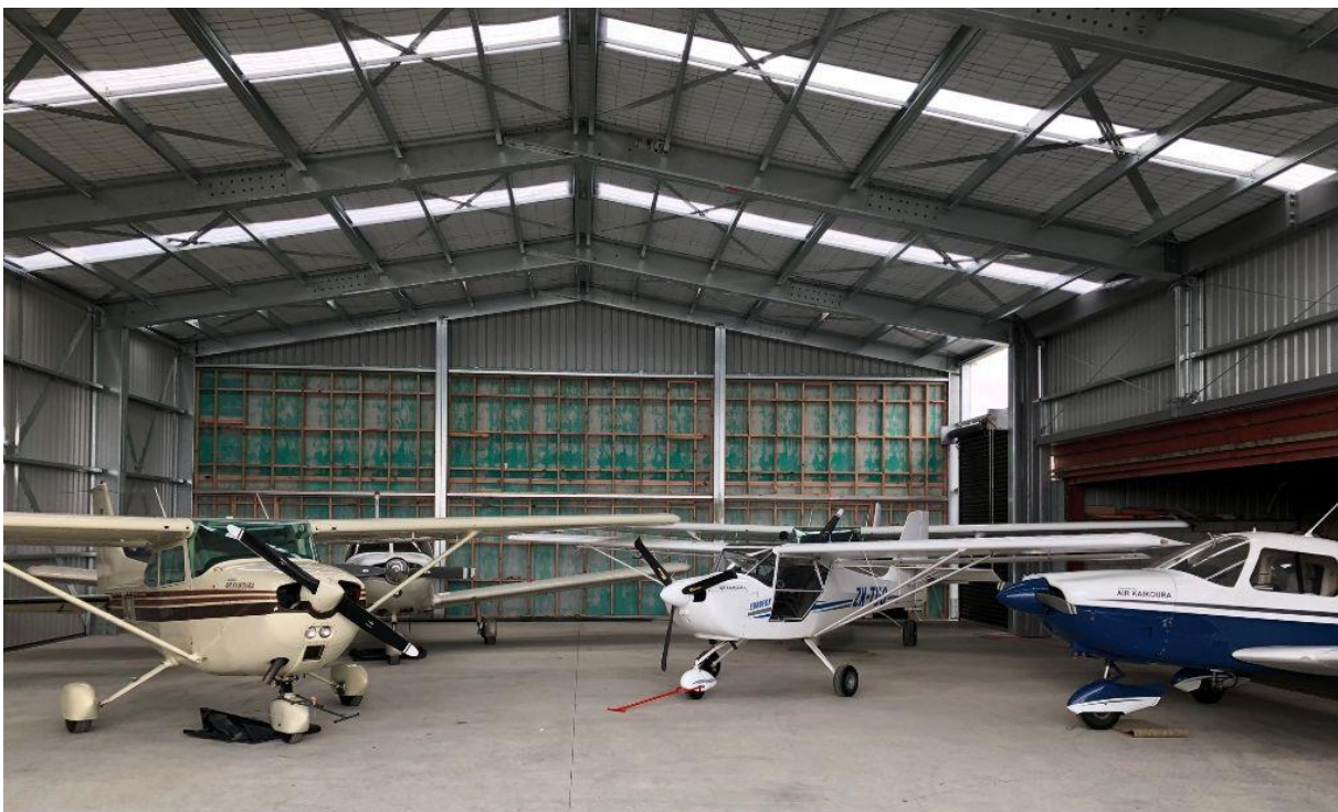
Sheltered from the elements

Since the last Newsletter the Hangar has come a long way. The walls are closed in and the electric door is on and fully operational. Visitors are very impressed by it and the planes look great inside. Gone are the old heavy, iron doors of the original hangar and the effort required to open and close them. Phewww.