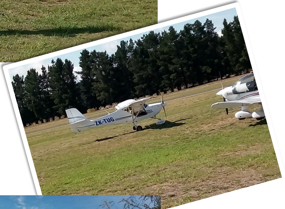
TUG lines up at West Melton...